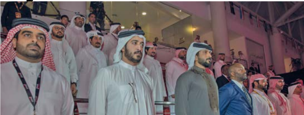
HH Shaikh Khalid bin Hamad Al Khalifa and HH Shaikh Nasser bin Hamad Al Khalifa look on during the event

HH Shaikh Nasser's statement came during his inauguration to the BRAVE International Combat Week in the presence of HH Shaikh Khalid bin Hamad Al Khalifa, First Deputy President of the Supreme Council for Youth and Sports and President