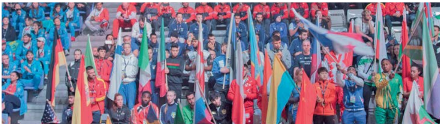
Audience cheer during the event

The "Brazilian Army" will be completed on November 12, with the arrivals of the remaining three members.