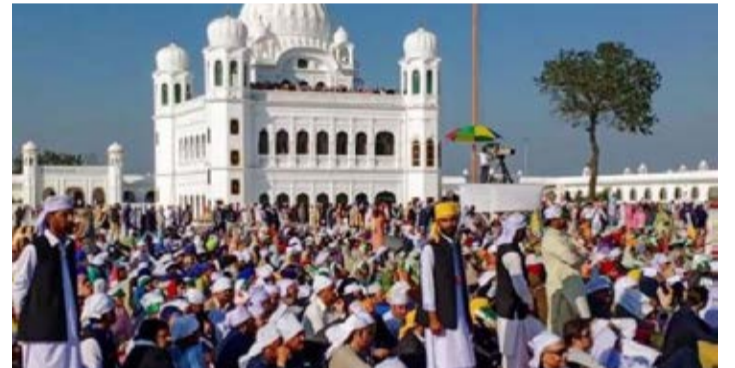
Sikh pilgrims visit the shrine of their spiritual leader Guru Nanak Dev, at Gurdwara Darbar Sahib in Kartarpur, Pakistan