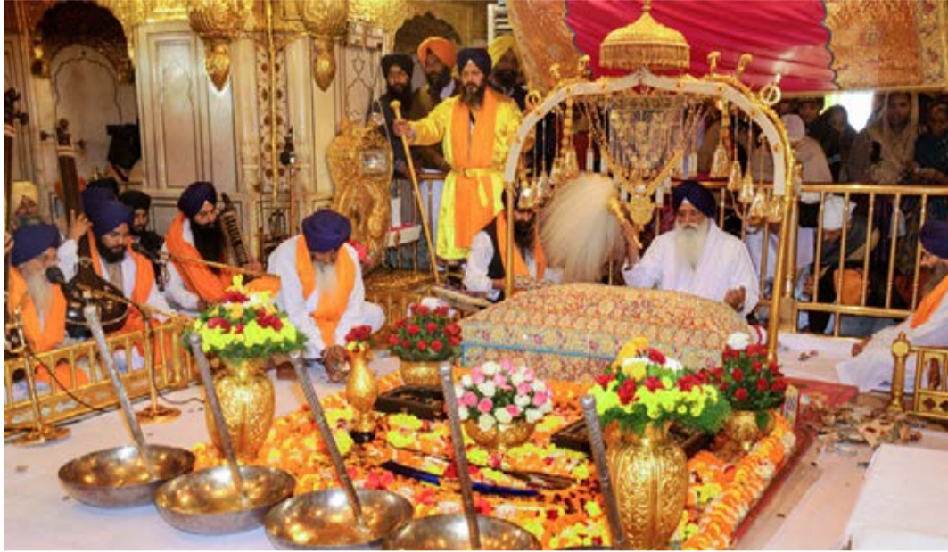
A display of 'Jalao' (Sikh symbolic items), inside the Sri Harmandir Sahib (Golden Temple) on the occasion of the 550th birthday anniversary of Guru Nanak Dev Ji, the founder of the Sikh faith, in Amritsar

occasion of the 550th Birth Anniversary of Guru Nanak Dev Ji, several programmes are being held across the country and the world through Embassies.