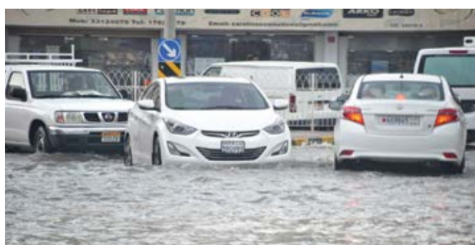
Spells of showers caused misery to many in Bahrain last year.

Recently, the ministry had met with municipal council members where the rainy season was a strong point of discussions.