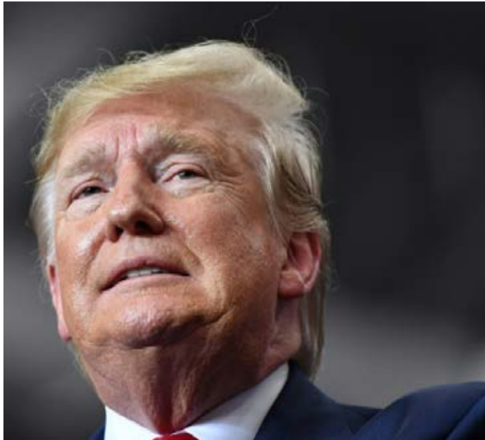
Donald Trump denied China's statement that the economic superpowers had agreed a plan to roll back tariffs as trade talks progress

Stock markets mostly slid yesterday as traders reacted to fading US-China trade deal hopes, renewed unrest in Hong Kong, a stronger pound and political impasse in Spain.