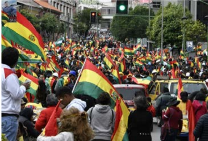
People celebrate in La Paz after the resignation of Bolivian President Evo Morales

"It's a coup because the army requested the resignation of the president, and that violates the constitutional order of that country," Ebrard told report-