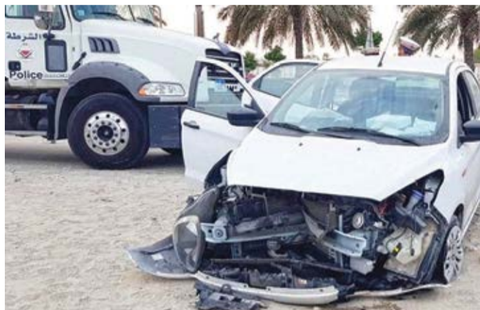
A woman died in the accident that occurred on Shaikh Isa Bin Salman Highway.

The fourth fatality caused by a traffic accident was also reported in the Capital Governorate on Saturday. Sources said a Gulf national