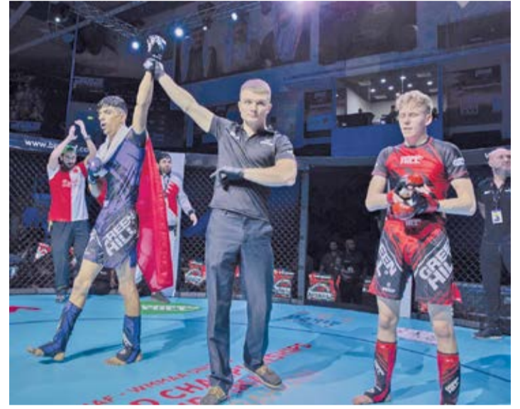
A winner celebrates after a fight