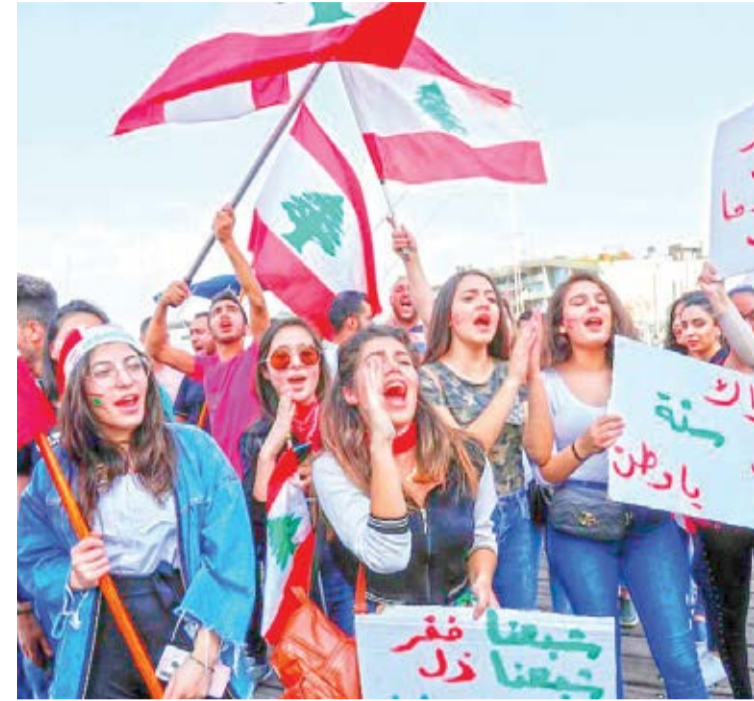
Lebanese demonstrators gather and picnic at Beirut's Zaitunay Bay during a protest.

Meanwhile, Shiite clerics have, in their sermons, fearlessly delivered stinging rebukes against the ayatollahs of Tehran and sectarian militias, questioning why citizens protesting their hunger and misery should be confronted with