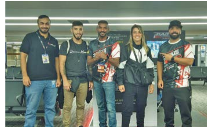
Brazilian fighters upon their arrival in Bahrain