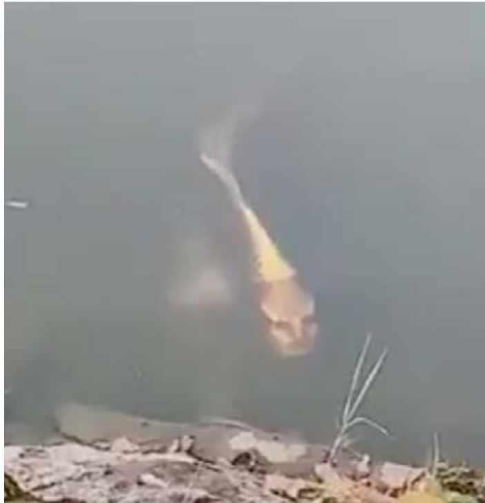
The carp, with its face marking resembling a human, was found by a visitor to Miao Village in China

Residents in northeastern Taiwan's Yilan County also reported sighting a black-and-white carp with features resembling a human face.