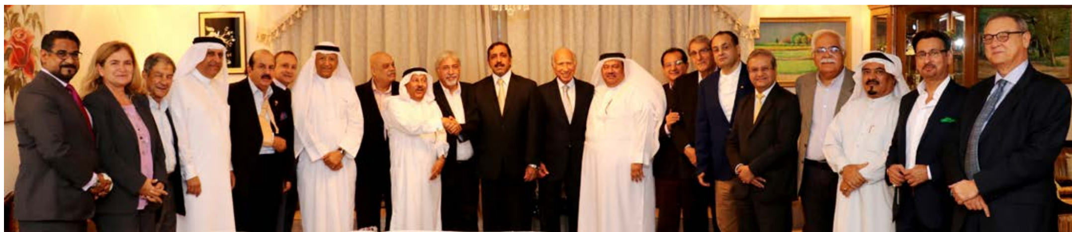
The Ambassador of Pakistan Afzaal Mahmood with prominent Bahraini businessmen and members of Rotary Club on 11 November during an exchange of views on strengthening trade and investment ties between Pakistan and Bahrain

The latter reported third-quarter net profit of 829 million Egyptian pounds ($51.52 million), compared with 1.13 billion Egyptian pounds a year earlier.