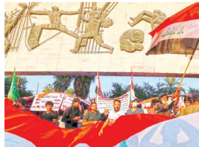
Demonstrators gather during the ongoing anti-government protests in Baghdad.

When Mr Abdul Mahdi first took up his post just over a year ago, there was hope of some of these endemic problems improving because he did not belong to a particular political party. He assumed power