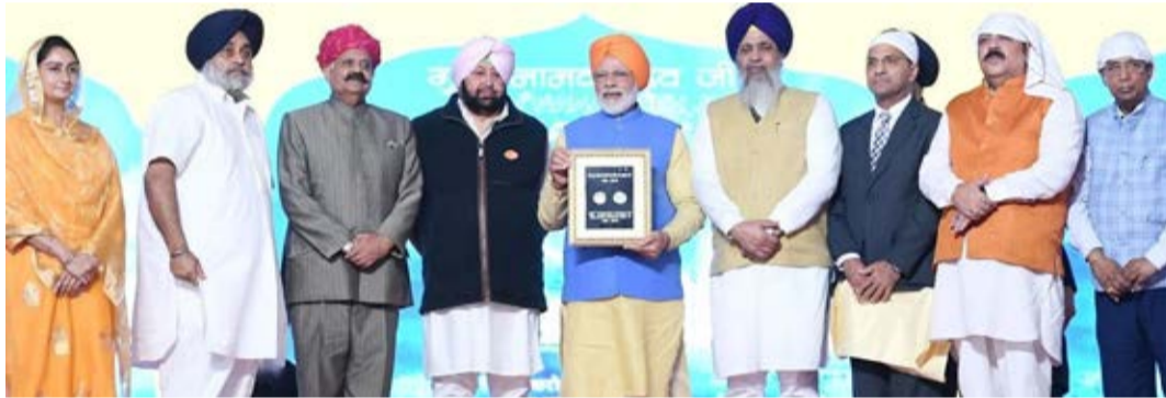
Prime Minister Narendra Modi releasing a commemorative coin celebrating 550th Birth Anniversary of Guru Nanak Dev Ji

The deal allows for up to 5,000 pilgrims a day to cross.