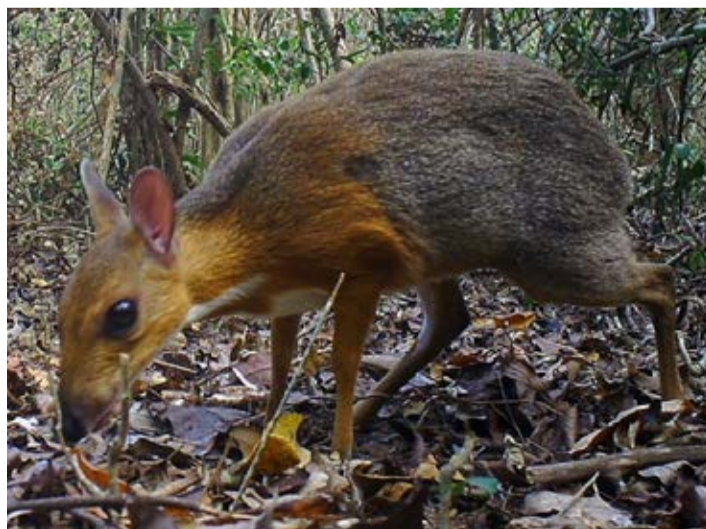
A still from a remote camera shows the Silver-backed Chevrotain -- long considered to be near-extinct -- in a forest in central Vietnam

A very rare species of small, deer-like animal thought to be on the verge of extinction has been spotted in the northwestern jungle of Vietnam for the first time in nearly 30 years. Known as the Silver-backed