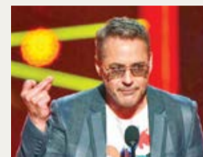
Robert Downey Jr

Robert Downey Jr pays tribute to Stan Lee