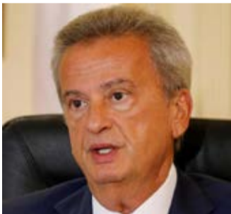
Lebanon's Central Bank Governor Riad Salameh

Lebanon is in urgent need of a new government to enact emergency economic measures. The head of the powerful, Iran-backed Shi'ite group Hezbollah, said he wanted to avoid public discussion of closed-door talks over the new government, saying he wanted to leave the door open for an agreement.