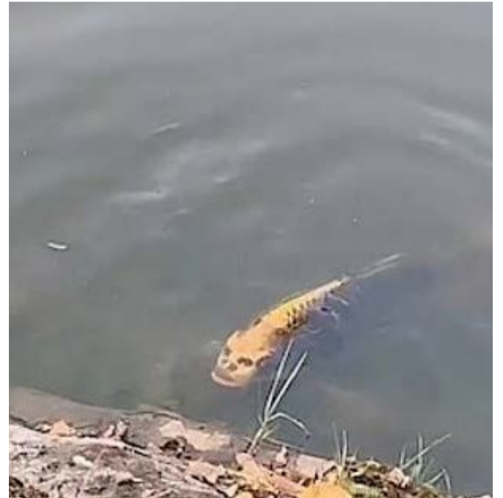
A side view of the British man's carp shows it looking a lot more fish-like. The fish, owned by Brendan O'Sullivan of Dagenham in Essex, was said to be worth an estimated £40,000