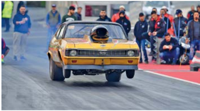
A participant in the drag racing championship (file photo)

● Participants are set to compete in 16 categories for both cars and motorbikes