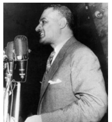
Egyptian President Gamal Abdel Nasser announcing on July 26, 1956 that he is nationalising the Suez Canal

On August 6, 2015 President Abdel Fattah al-Sisi officially opened a new route along the