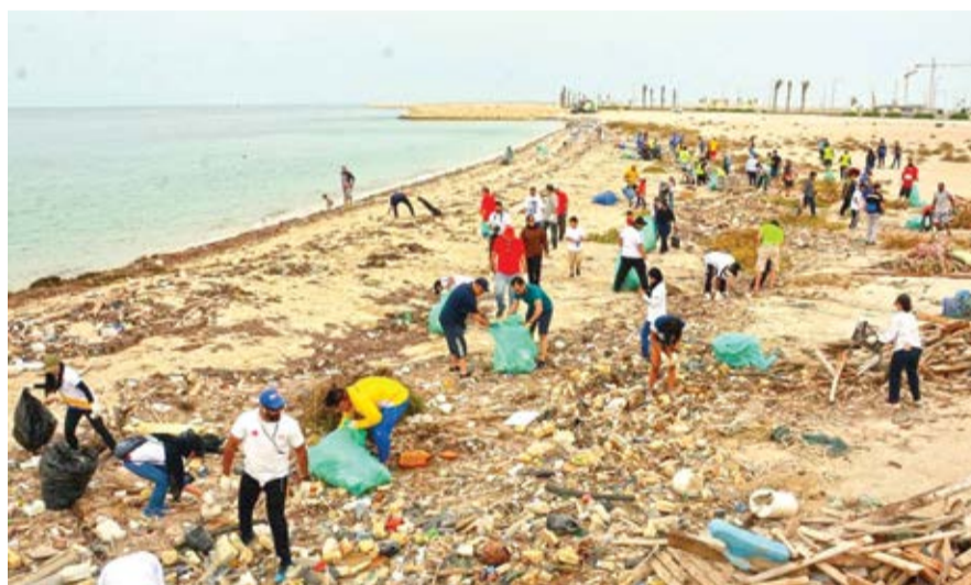
Volunteers carry out the clean-up drive on the coast of Northern Governorate.

He also praised all the participants for their handwork. "The participation of such a huge number of volunteers reflects