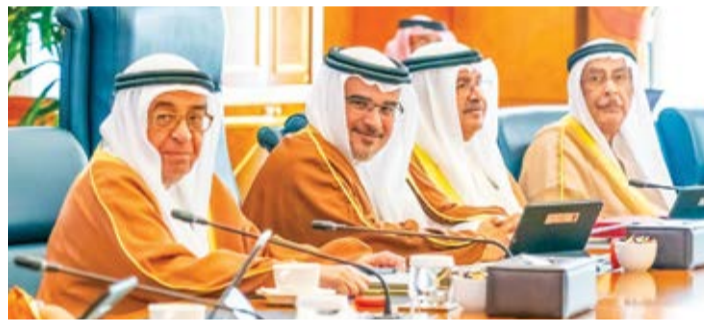
HRH the Crown Prince chairs the Cabinet.

The Cabinet chaired by His Royal Highness Prince Salman bin Hamad Al Khalifa, Crown Prince, Deputy