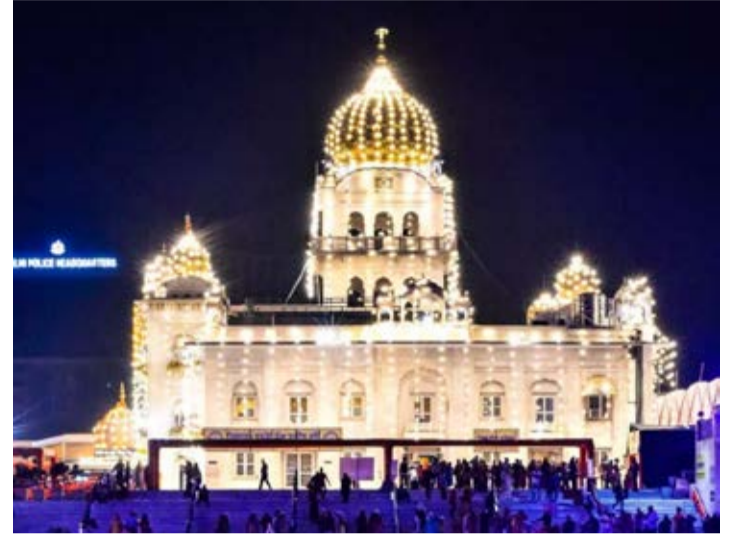
Gurdwara Bangla Sahib seen illuminated on the occasion of the 550th birth anniversary of Guru Nanak Dev ji, in New Delhi