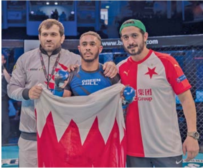
HH Shaikh Khalid bin Hamad Al Khalifa with a winner

Throughout the day, HH Shaikh Khalid bin Hamad Al Khalifa proved once again his commitment to the sport of MMA, and its development in the Kingdom