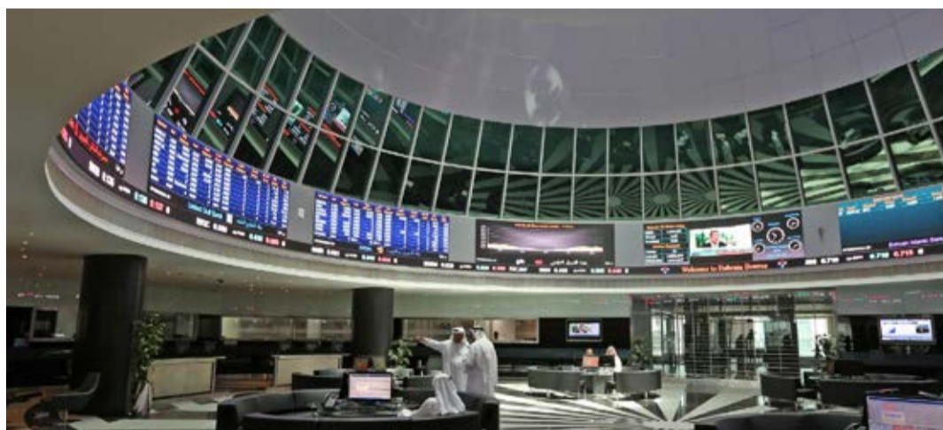
Traders on the floor of Bahrain Bourse (file)

third-quarter net profit of United Arab Emirates’s only listed airline jumped 57pc, which it attributed to a 10pc rise in passengers carried from its hubs in the UAE, Morocco and Egypt.