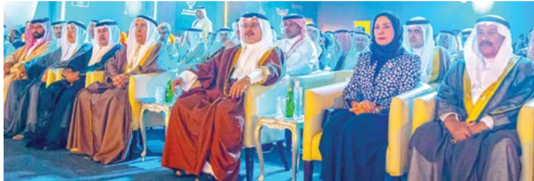
HRH the Crown Prince at the conference in the presence of Deputy Premiers, House Speaker and Shura Chairman.

● The Crown Prince highlighted that innovation and creativity safeguard the resilience of the national economy.