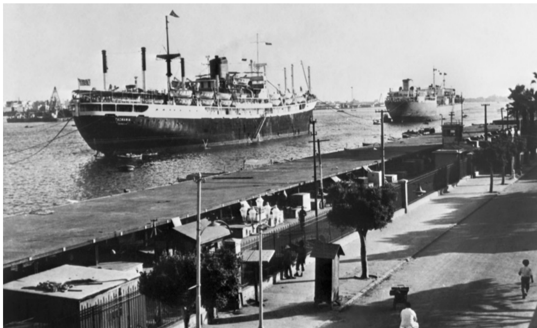
Ships on the Suez Canal in 1956, the year Egypt nationalised the waterway and sparked a major crisis with Britain, France and Israel

De Lesseps founded the Suez Canal Company in 1855 and the work was financed through the sale of shares, half of which were bought by the Egyptian ruler. Digging began in 1859, at first