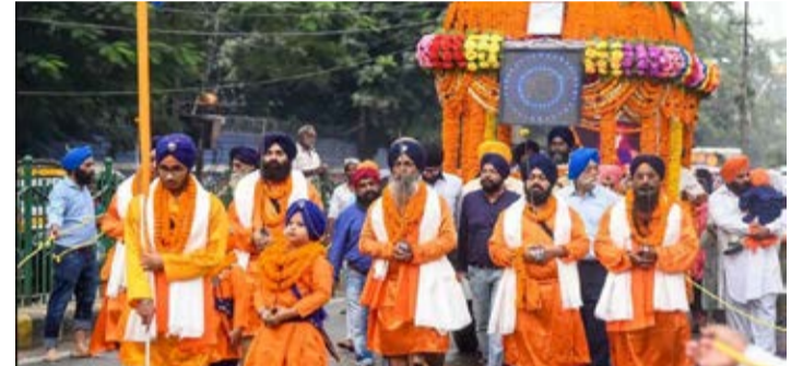
Sikh devotees participate in a religious procession during the 550th birth celebrations of their founder guru, Guru Nanak Dev, in Patna