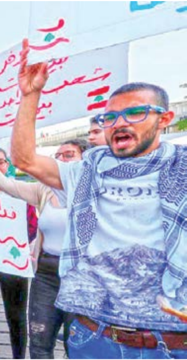
against the privatisation of public spaces.

Erdut Agreement regarding the peaceful resolution to the Croatian War of Independence was reached.