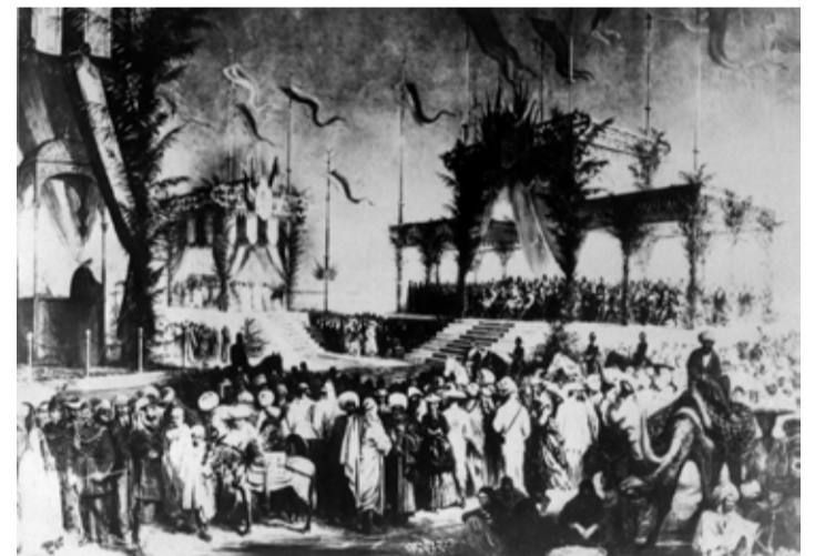
The inauguration of the Suez Canal in November 1869 was a lavish affair attended by French Empress Eugenie de Montijo

Egypt closed it again in June 1967 during the Six-Day War when Israeli troops invaded