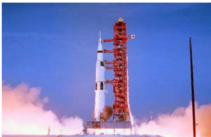
A scene from 'Apollo 11'

The film premiered at the Sundance Film Festival on Jan-