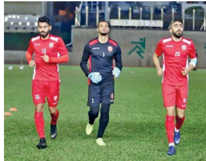
Players warm up at the start of their training session in Hong Kong